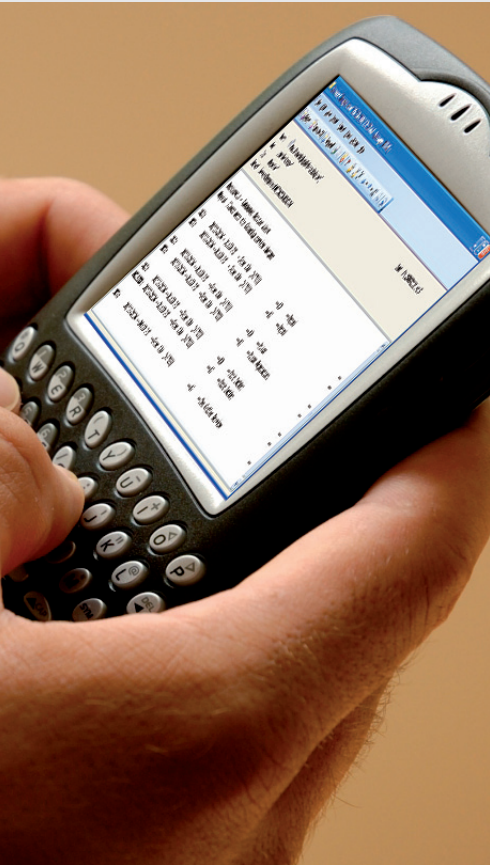
Left: Multi-property calendar for instant availability